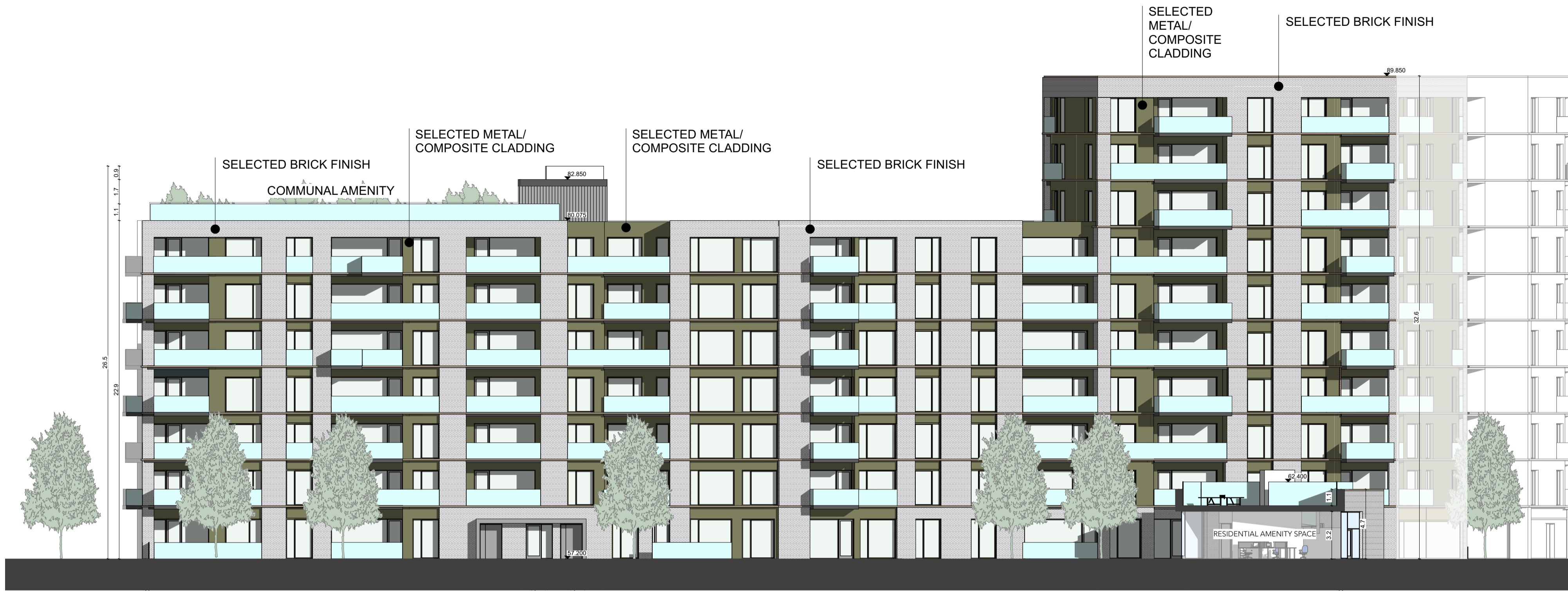
Elevation C-C SCALE : 1:200